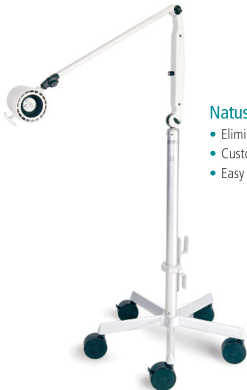
Natus LED Photoc Stimulator