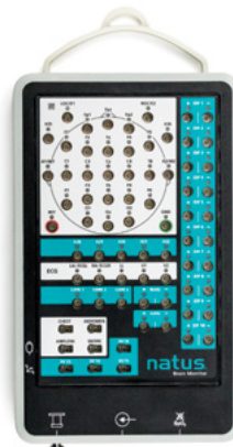
Natus Brain Monitor*

Versatile amplifier expandable for different testing options